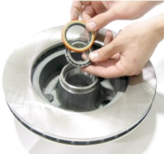
Inner Bearing Assembly