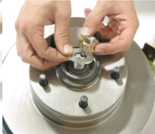
Outer Bearing Assembly

Note: Drilled and/or slotted rotors are directional. Be sure you have the appropriate rotor for the side of the car you are working on. Left is driver's side, right is passenger's side.